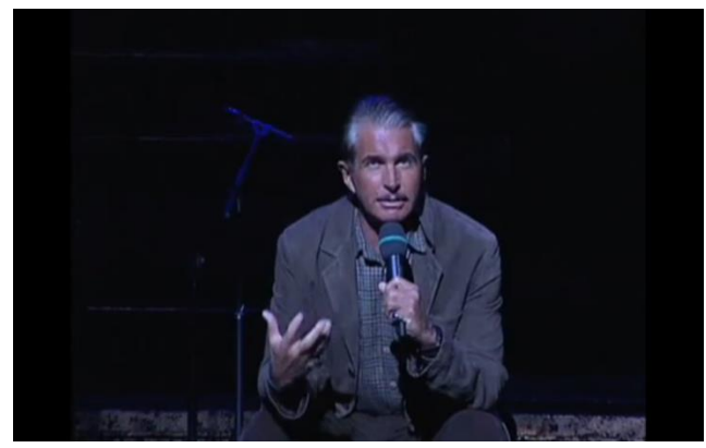
George Hamilton, Broadway and Film Actor, speaks at a Chicago Day on Broadway